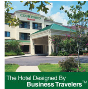
Courtyard Marriott www.courtyard.com/slcc